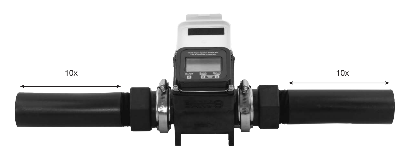
X = Diameter

It is recommended to have at least 30 inches of straight pipe before the flow meter and at least 30 inches after.